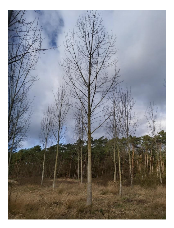
Dender, Zoutleeuw (Belgium)