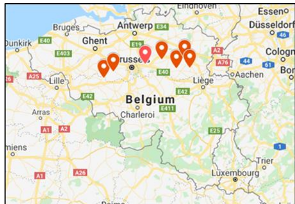
Fig 3. Soil properties of the 7 field sites mentioned below

MAI has been measured in 7 field trials aging from 8 to 13 years and installed in the north of Belgium on different soil types – planting distance 8m x 8m