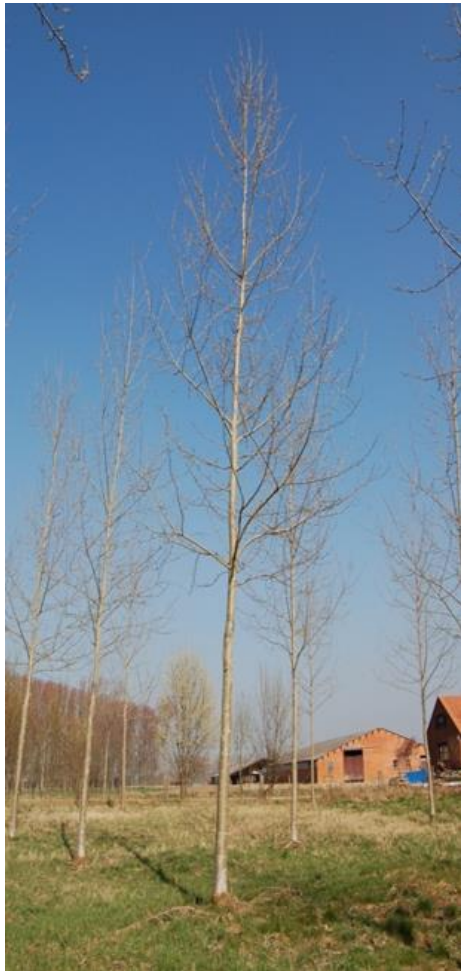
Skado – tree form and branchiness