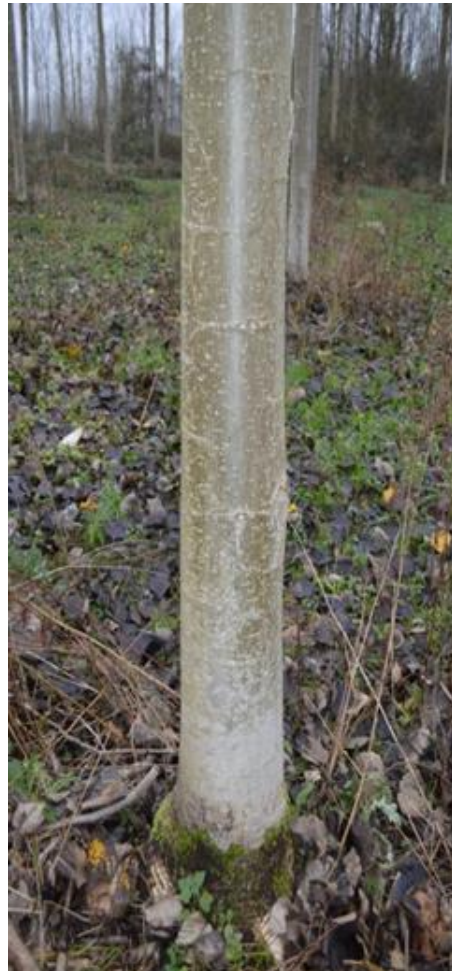
Skado – trunk form and color